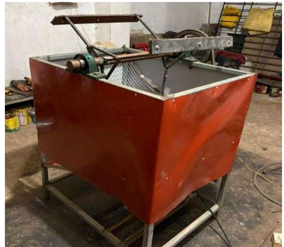
Fig no 2. Model

The diagram shows a penute shell removing machine working principle