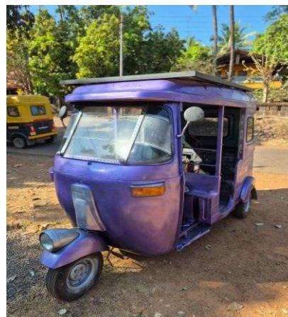
Fig no. (01) Electrical

The purpose of the electrical autorickshaw with solar charging system is to encourage environmentally friendly transportation while consuming less fuel. A BLDC motor is powered by a battery pack via a motor controller. The autorickshaw's roof is equipped with a solar panel that collects sunlight and produces electricity. To safely charge the battery, an MPPT charge controller regulates the generated solar power. Additionally, the battery has a Battery Management System (BMS) to guard against deep discharge and overcharging. The electrical components and solar panels are mounted securely through proper fabrication. Following assembly, testing is done to assess the system's overall performance, charging time, vehicle range, and solar efficiency.