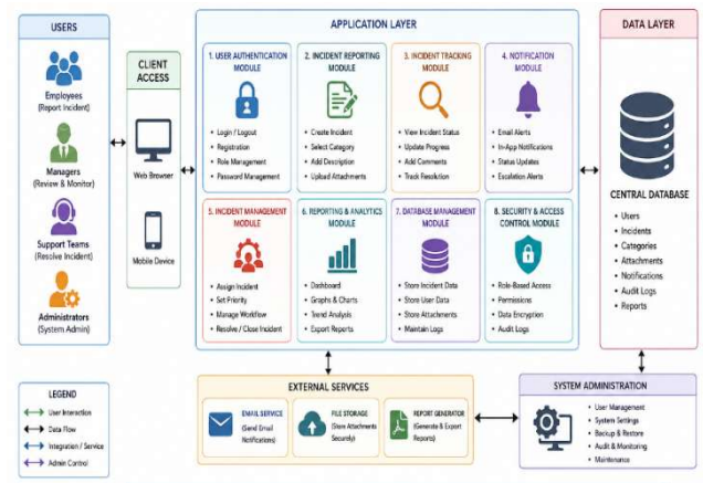
Fig 5.1 Architecture

Protects sensitive information through authentication, authorization, encryption, and secure data handling mechanisms.