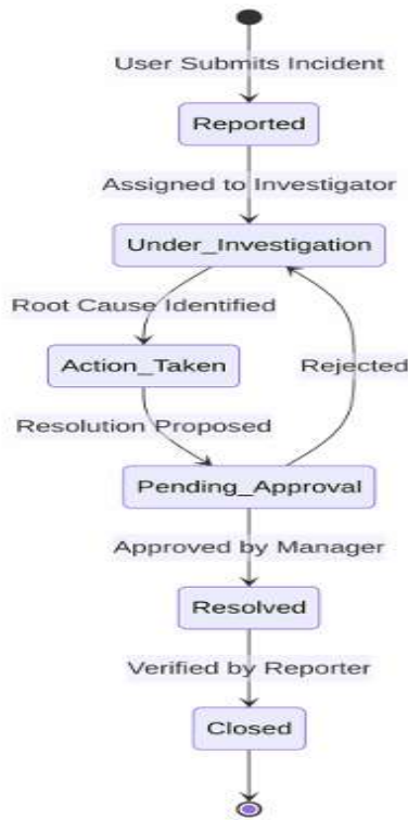
Fig 6.1 Workflow

The workflow improves communication, reduces response time, enhances accountability, and supports data-driven decision-making within the organization.